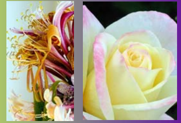
Flowers of June